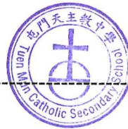
Cheng Suk Wah

The reply slip should be submitted by 5 th September.