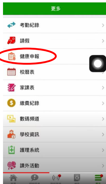
Choose 'health declaration'

Starting from 22 nd April, parents and students should download the latest version of E-Class app. There is a new function named health declaration in the app.