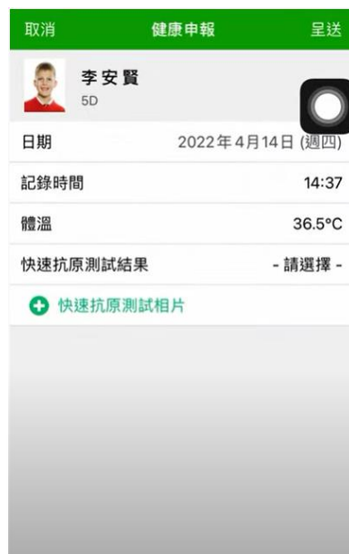
Insert the body temperature