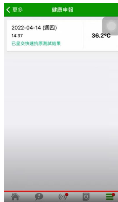
Check the submitted record