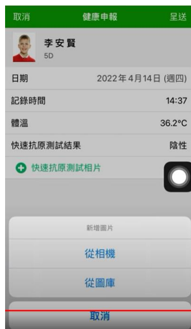
Uploaded the signed photo with the testing kit