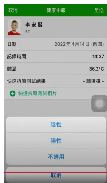
Report the testing result